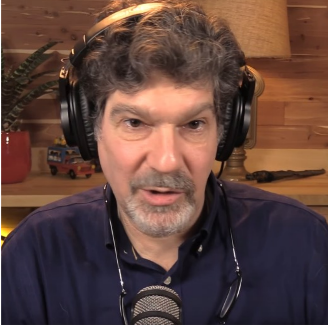
J.B. Peterson Podcast - S4E10: Bret Weinstein