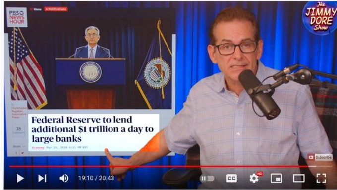
#TheJimmyDoreShow Bill Maher Gets Schooled On Economics By Progressive