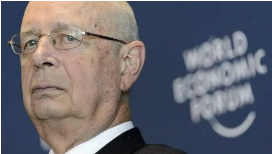
Klaus Schwab, Kissinger Protege

Kissinger personally discovered and groomed Klaus Schwab , Executive Chairman of the World Economic Forum, to become today's droning specter of the Great Reset, our impending technocratic tyranny. Kissinger spoke with Schwab on stage (by virtual stream) at the WEF's 2022 annual conference, in a speech titled " Kissinger: These are the main geopolitical challenges facing the world right now. "