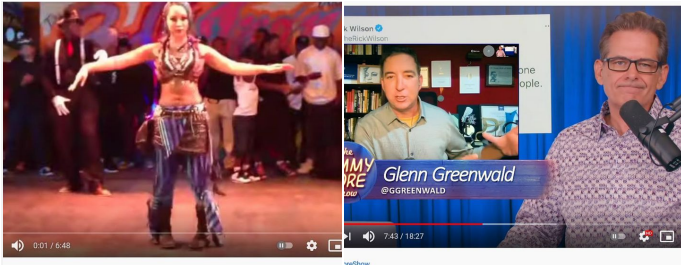
ver - Egypt Egypt (12 Inch) (Intro) (1984) ermann Welcomes Government Spying On Journalists