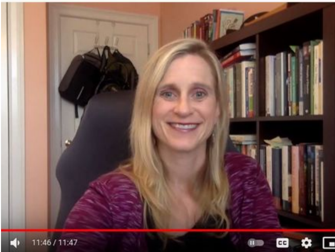
Judith Thomson - A Defense of Abortion [Philosophy Audiobook] Jul 21, 2020