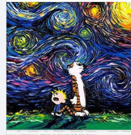
MIA STREAM: TRIPLE FEATURE EDITION