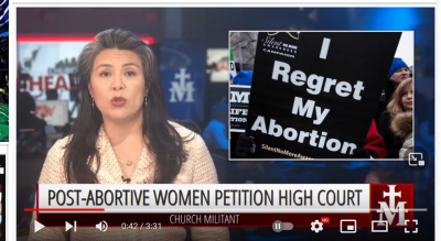
Catholic - Headlines - November 30th, 2021