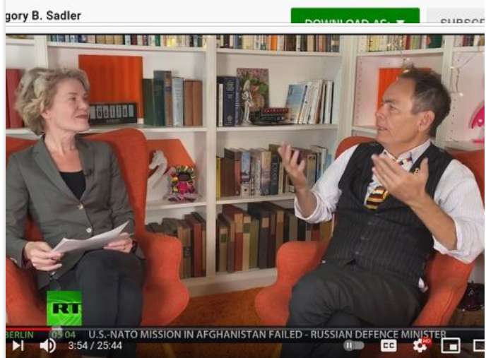
Report | No Resistance | E1729 vs • Jul 29, 2021