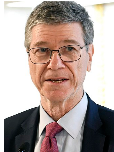
Sachs in 2019