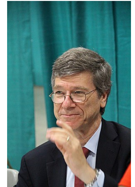
Sachs in 2015

In April 2018, he supported President Donald Trump 's view that the United States should come out of Syria "very soon", adding: "It's long past time for the United States to end its destructive military engagement in Syria and across the Middle East, though the security state seems unlikely to let this happen". [58][59]