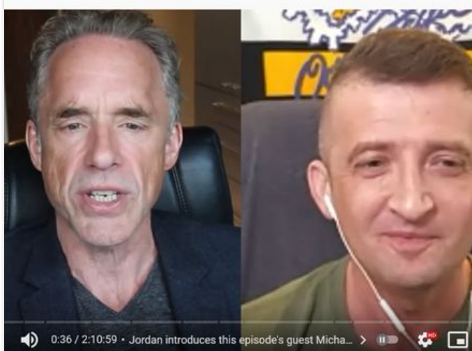
the Establishment? | Michael Malice | The Jordan B. Peterson Podcast - S... Jun 14, 2021 3.5K 33 SHARE